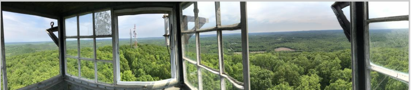
A panoramic view from the top of the fire tower on Mt. Shepherd.

The flowers steal the show. During the summer months, the spike supports orchid flowers with yellowish petals striped with purple and brown lines. Like many orchids, its flowering is unpredictable, so finding it in bloom takes some