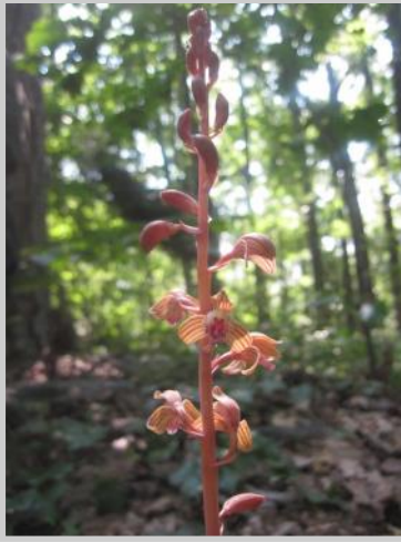
Crested coralroot

One rare plant found on Mt. Shepherd in Randolph County is a native orchid, Hexalectris spicata (Crested coralroot). Crested coralroot ranges from Maryland south to Florida and west to Ohio and New Mexico, where it is more common in the western states. It prefers soils that are more basic (not acidic), which can be found in the ancient, decomposed volcanic rock that occurs in this special area. Only periphery populations occur in North Carolina, and because of its limited habitat and marginal populations, crested coralroot is listed as Significantly Rare in this state by the NC Natural Heritage Program.