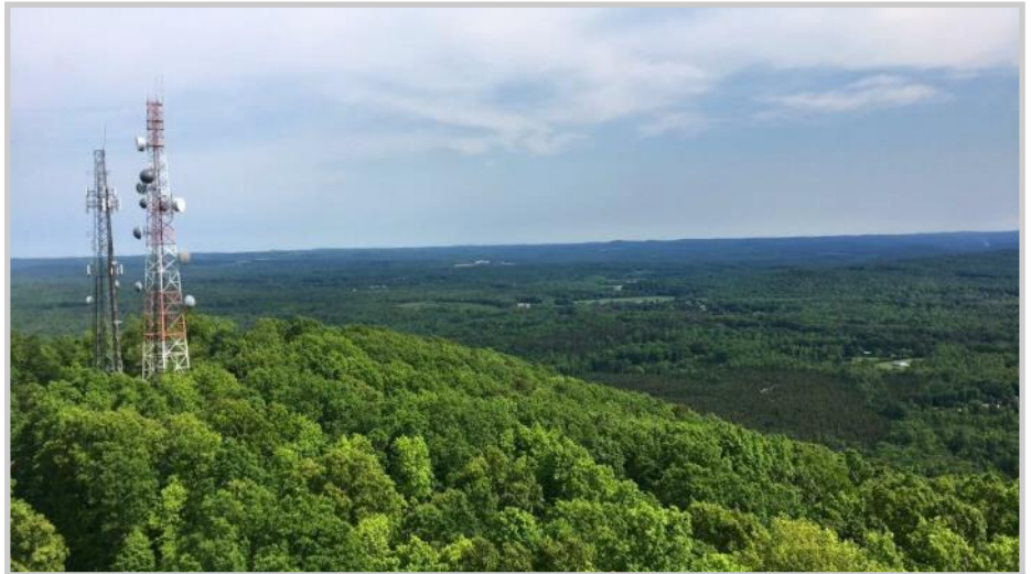
The view from atop Mt. Shepherd.

"Many ecological reasons exist to conserve this beautiful landscape, but equally as important is that the property will remain a place for young people to connect with nature."