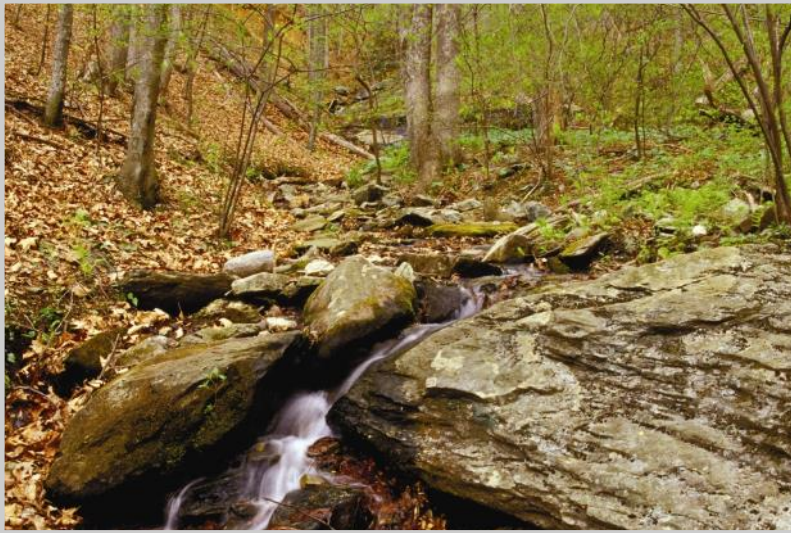
One of several tributaries that originates at Wellspring Mountain.

Wellspring Mountain, an herbal retreat and conference center located near Lowgap, NC has now officially purchased the land from PLC that it sits on, a 500-acre property that was previously Camp E-Munta-lee and home to the Eckerd Youth Alternatives program for troubled youth. In addition to beautiful woodlands, the property also includes a 40-acre campus with 18 structures for lodging and activities.