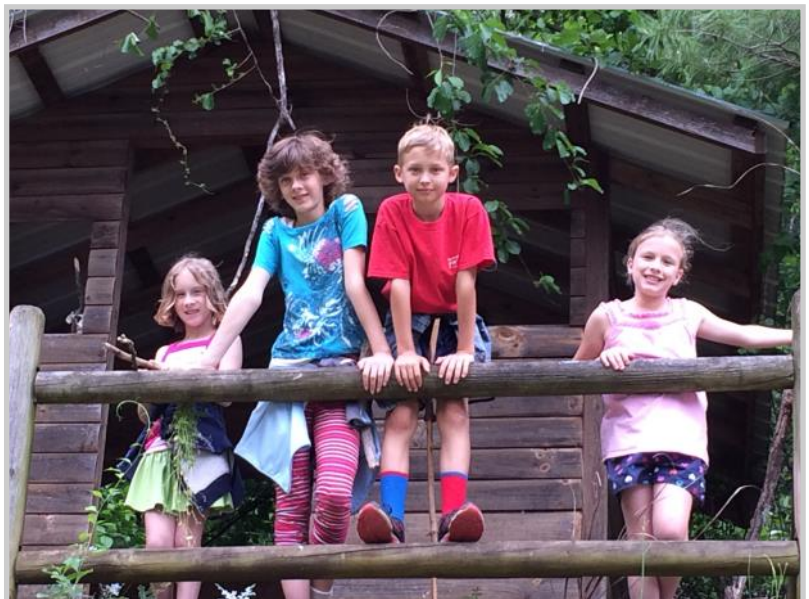
Children enjoying Wellspring Mountain at one of the many events held here throughout the year.